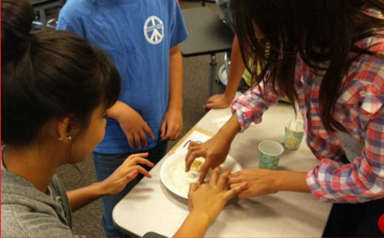
Plate Tectonics at its best, with frosting and graham crackers, these middle school students had a blast!