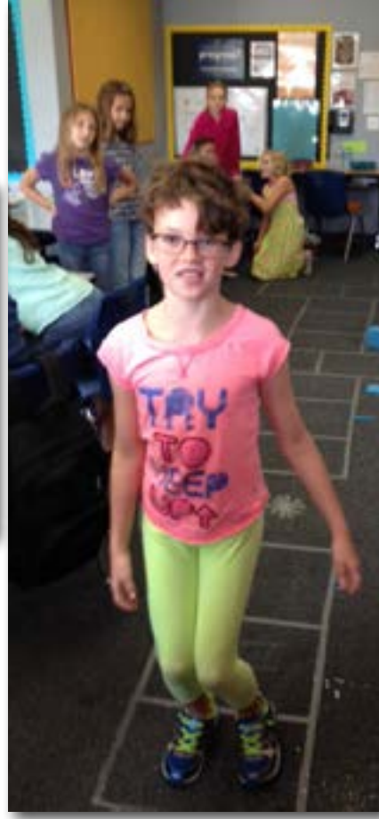
The Elementary staff used hopscotch to practice using place values.

The Da Vinci Middle School Springs Has Heart community service club is currently participating in Socktober. We are collecting donations of items such as new socks, toothpaste, deodorant, basic first aid supplies, non-perishable single-serve food, and bottled water which will be packed into gallon-size ziploc bags to create care packages for the homeless. Participating families will keep the filled bags in their cars to be distributed to those in need.