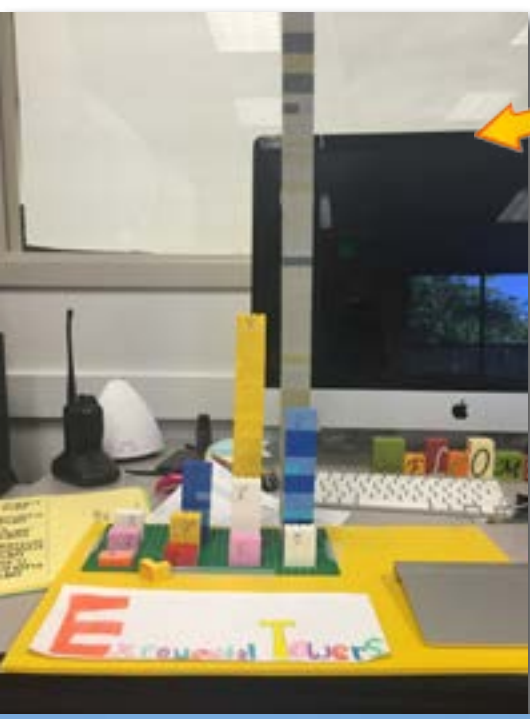
Legos were used to create exponent towers.