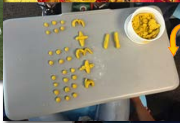
Middle School students used clay to create expressions in Math.