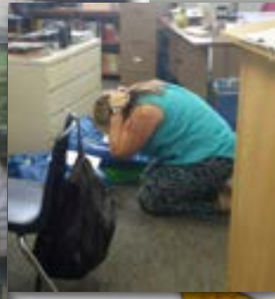
Millions of people worldwide practiced how to Drop, Cover, and Hold On at 10:15 a.m. on October 15th during Great Shake Out Earthquake Drills. It is estimated that 5.8 million students and staff participated in the Shake Out and Flabob Airport Preparatory Academy was part of this great event.