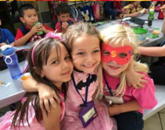
“ Don’t Be a Bully, Be a Super Hero” was the theme for one of our dress up days for the Stop Bullying Campaign in October.