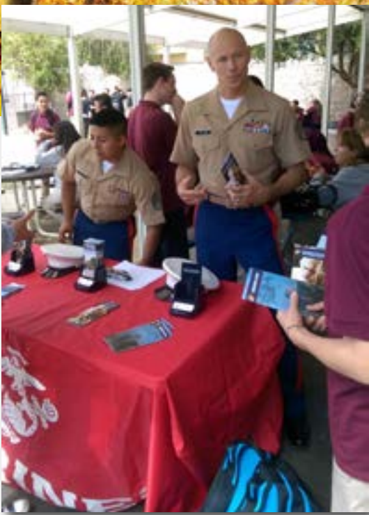
United States Marine Corp Recruiters visited Hemet Renaissance Academy last month. The recruiters offered important enlistment, career and educational information to our high school students. Our site was honored to host our local officers and support our amazing men and women who serve our country. U.S.A.! Freedom!