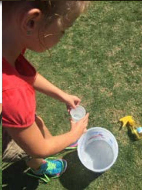
Drip drip splash game kept us cool on the hot days in San Diego.