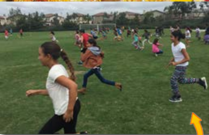
Enjoying fun games on the field for PE