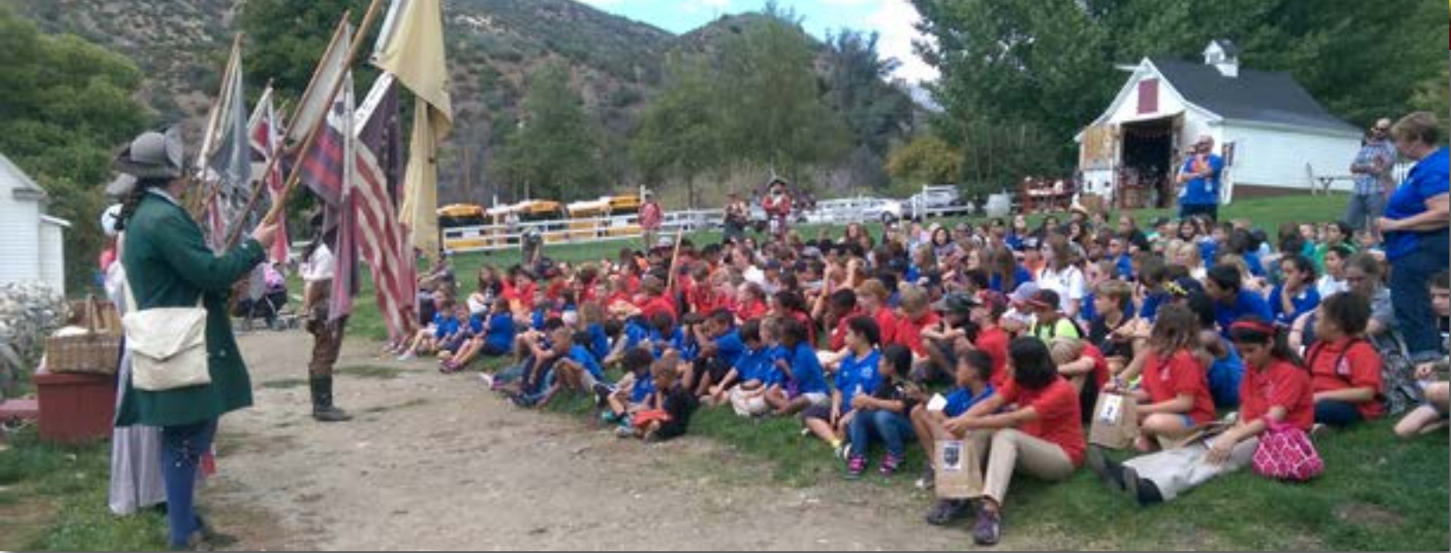
Our Hemet Quest students grades K-8 experienced a wonderful day at Riley's Farm in Oak Glen. Together we journeyed through several history stations and engaged in a re-enactment of the revolutionary war. This amazing tour was enjoyed by all!