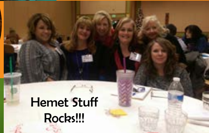
Hemet Stuff Rocks!!!