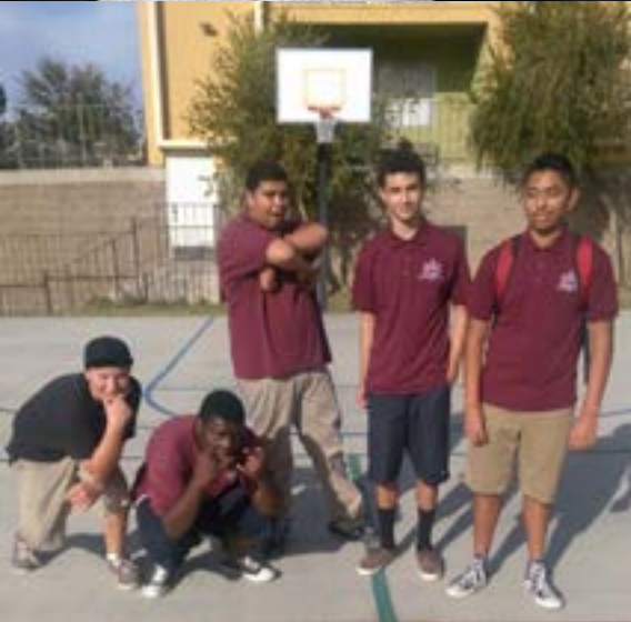
Freshmen/Sophmores vs Juniors/Seniors Basketball Game Underclassmen dominated the uppers 28-22!